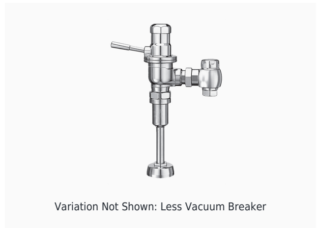
Variation Not Shown: Less Vacuum Breaker